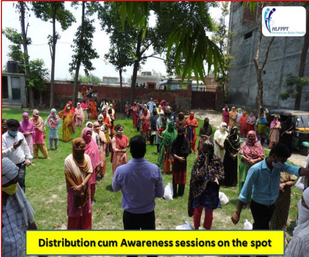
Distribution cum Awareness sessions on the spot

Thank You for your generous support & donation so far to enable us for distribution of free ration and health kits to the under-served communities of Delhi/NCR