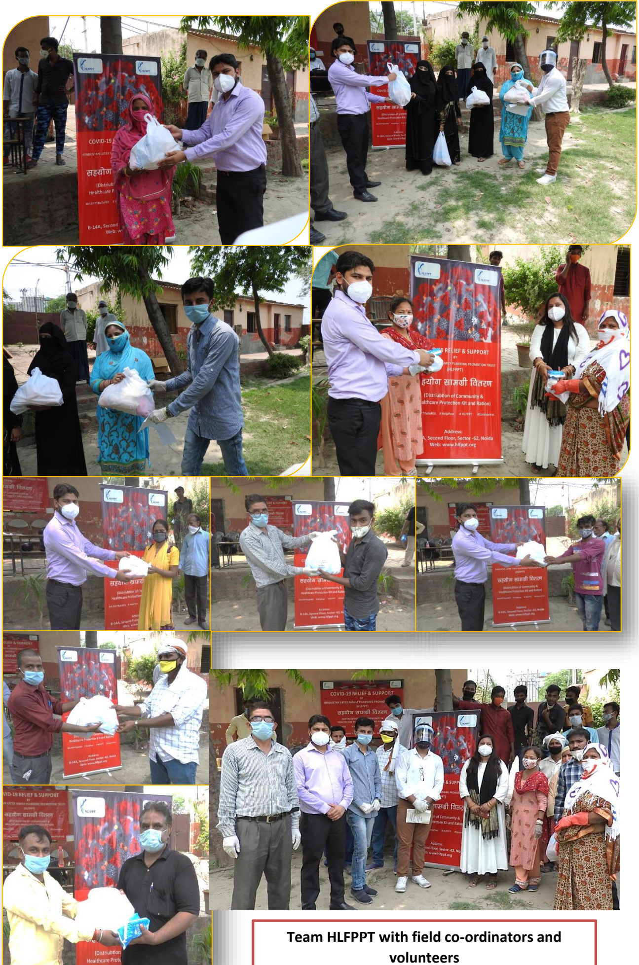
Team HLFPT with field co-ordinators and volunteers