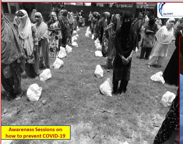
Awareness Sessions on how to prevent COVID-19

Empowering Women to speak about Menstrual Hygiene and also we have distributed nearly 100 Ration and Medical Kits to provide immediate relief from COVID-19. Thank you to all of our donors for having faith on us