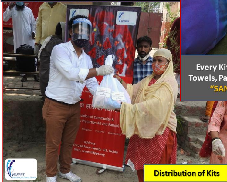
Distribution of Kits

Every Kits Contains- Mask, Sanitiser, Rin Detergent, Hand Towels, Parle-G Biscuits, Poha, Breads and most importantly- "SANITARY PADS" to promote Menstrual Hygiene