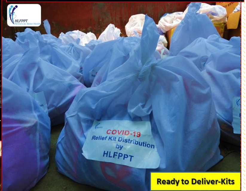
Ready to Deliver-Kits

COVID-19 Support and Relief Camp organised by HLFPT to deliver immediate relief to the families affected with COVID-19. Ration and Medical Kits were distributed. Thank you to all of our donors for having faith on us.