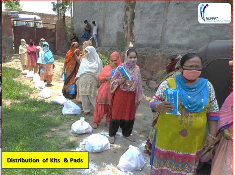
Distribution of Kits & Pads

Thank You for your generous support & donation so far to enable us for distribution of free ration and health kits to the under-served communities of Delhi/NCR