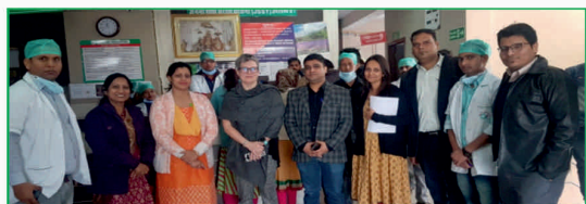
USAID team visited Utkrish Hospital supported by HLPPT