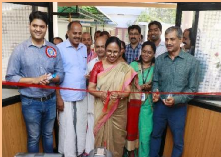
Inauguration of COE-Elderly Care Home by Smt. K K Shailaja, Hon'ble State Minister (H&FW) Kerala