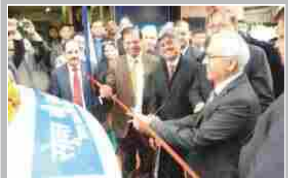
Launch of MMUs by Sec. of Ministry of Power-Gol