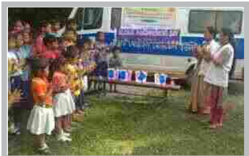
Staffs of MMU Assam are teaching Hand Washing techniques to School children

Each MMU consists of a team encompassing of Doctor, ANMs, Ophthalmic Technician, Lab Technician and Pharmacist. They also provide counselling to the community on various health issues through awareness sessions at grass root level during the health camp. Special thematic health camps were also organized for school children, adolescents, pregnant women on Deworming day, hand washing, Menstrual Hygiene, Anaemia, ANC & PNC, Nutrition Awareness. The MMU project has also been integrated with other vertical programmes and hence benefitted the large number target community.