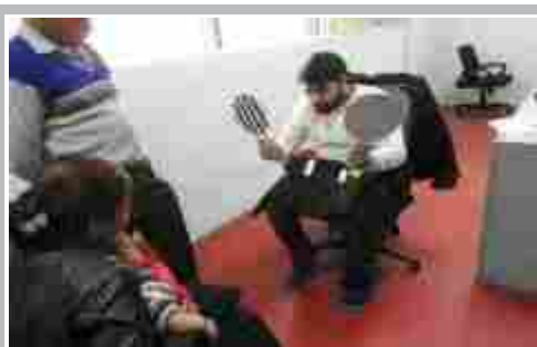
Performing Eye Check-up at DEIC-NOIDA

The Centre of Excellence has been established & operationalized to provide early detection, intervention and referrals for all infants discharged from SNCU, children referred from RBSK, Mobile Health Teams, Delivery points, ASHA, Private medical practitioners and by