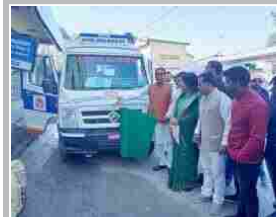
Function to launch of the MMU, Uttarakhand

NHM Uttarakhand has awarded HLPPT with 5 MMUs for operationalization and management in Uttarakhand by signing a MoU on 18 th February 2019 for a period of one year initially. These MMUs will provide free primary healthcare services to the underserved population of Pithoragarh, Champawat, Almora, Uttarkashi and Paudi districts.