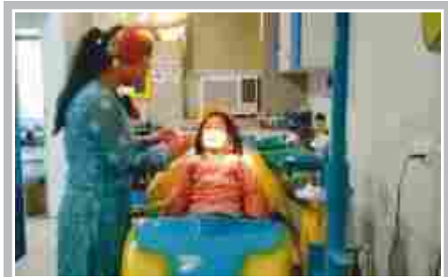
Dental Care Room at DEIC, NOIDA

Apart from this, another DEIC is being operationalised in Ghaziabad. Other proposed DEICs are located in Delhi, Haryana, Chhattisgarh, Assam, Jharkhand, UP, Kerala.