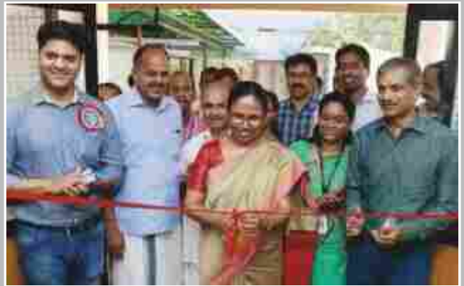
Inauguration of COE-Elderly Care Home by Smt. K K Shailaja, Hon'ble State Minister (H&FW) Kerala