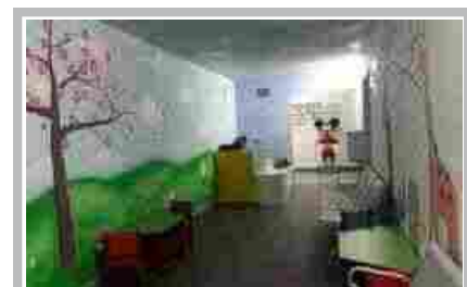
DEIC Ghaziabad, UP

For More information about RBSK Program, click at www.rbsk.gov.in/RBSKLive/ and to know about the Component of National Health Mission, click at www.nhm.gov.in .