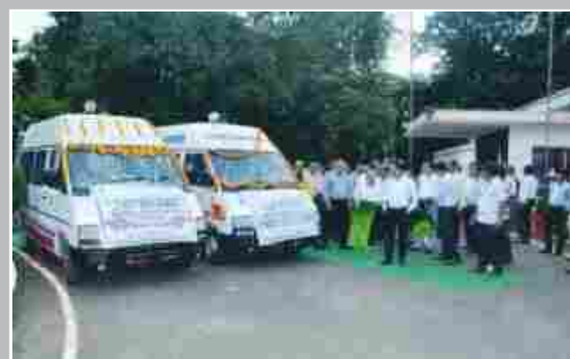
Flag-off ceremony to launch two MMUs in West Bengal

For a duration of three years, two Mobile Medical Units were Inaugurated on 1 st June 2018 by ECL. The main deliverable through this Mobile Vans is to provide health care services including basic diagnostic and other services in the target geographical area. Both the MMUs are managed and operationalized by HLPPT. The service area of these MMUs is be Deoghar, Jharkhand and West Burdwan districts of West Bengal. Till date total 872 OPDs sessions have been conducted.