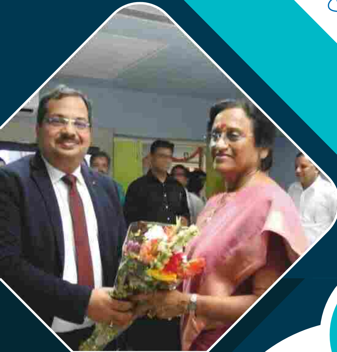
CEO-HLFPPT welcoming Hon'ble Smt. Rita Bahuguna Joshi, State Minister of Health and Family Welfare and Mother & Child Welfare & Tourism (UP) during the inauguration of COE-DEIC, Noida

Spreading Smiles Strengthening Health System