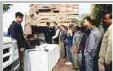
Registration process before Health check up

As a Program Implementing Partner, HLPPT and Power Trade Corporation India (PTC-India) has inked the MoU and launched Three Mobile Health Clinics under their CSR initiative in partnership with PTC Foundation Trust for operationalizing in three districts of Delhi/NCR.