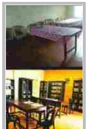
Fresh look of Reading Room