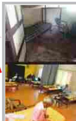
Then and Now of Dormitory