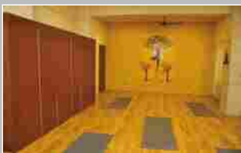
Yoga and Meditation Room

Functioning Mechanism: An MoU was signed on 7 th day of December 2018 for 3 years of duration between HLPPT (a unit of HLL Lifecare Ltd) and Social Justice Department, Government of Kerala to establish a model home by doing faceliftment of Govt. Old Age Home in Kannur District (Kerala) with a lively ambiance, good health care facilities, and lots of activities to engage elders. The project has been branded as "Second Innings Home". This center is providing the much needed elderly friendly services, which are easily approachable, usable, and adaptable and moreover it's very user-friendly.