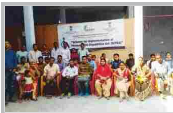
Candidates taking Skill Development training undertaken by HLFPPPT

Skill Development Department of HLFPPPT is implementing 34 skill training projects across states to support the flagship program of GoI "Skill India Mission". After the launch of Skill Development Department (SDD) in 2017, So far; we have been empanelled with Ministry of Minority Affairs and Ministry of Social Justice & Empowerment as Government Training Provider (GTP). In line with the objective of HLFPPPT to provide excellent services, Skill Development Department has also received the Best Training Provider Award for FY 2017-18 under the NULM project, Kerala.