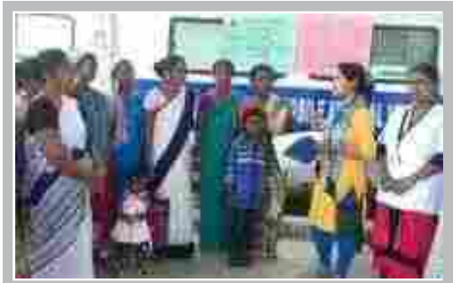
Spreading awareness on the Health Care Programs