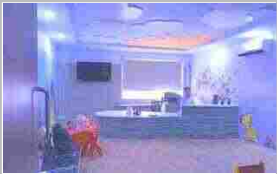
Reception area of COE-DEIC

With support from Ministry of Health and Family Welfare (MoHFW), HLPPT has been mandated by NHM Govt. of UP to establish & operationalize a Centre of Excellence (COE) DEIC and Training Centre in the State. For this a Tripartite MoU was signed between HLPPT, Super Speciality Paediatric Hospital & Post Graduate Teaching Institute (SSPH & PGTI) & DHS Gautam Budh Nagar in 2017. This centre is also acting as a regional COE for conducting the training for other DEICs technical staffs in the state of UP and beyond.