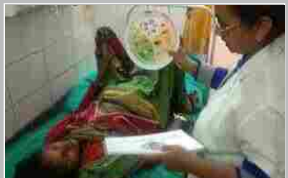
A Nutrition plate is demonstrated by Doctor to the beneficiaries for counselling

HLPPT is supporting, PMSMA program of Ministry of Health and Family Welfare (MoHFW) which was launched to provide quality antenatal care services to women in their second/third trimester of pregnancy on a fix date i.e, 9 th of every month. The initiative aims to ensure that assured and comprehensive antenatal services are provided to the pregnant women at designated health facilities by Obstetrician / Medical Officers of the respective district. To strengthen the qualitative tracking of the services from the community to the facility and back to the community, HLPPT is engaged in providing technical support to all the stakeholders like Medical Officers, Staff Nurse, ANM, ASHA and MTM (Merry Tarang Members of MGN) partnership with UNICEF India in 10 identified districts of Uttar Pradesh. To capacitate the service providers of the identified district health facility, a flip book with detailed information on antenatal care services, personal hygiene, nutrition and family planning has been developed to place with the service providers at the facility. A pictorial food plate with detail description about the types and color of required food has also been developed to place at the facility. Till date 13 Medical Officers, 70 HSP (Health service providers), 86 ASHA's and 34 MTMs have been trained in UP.