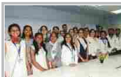
Team of Doctors and support staff at COE-DEIC (Noida)