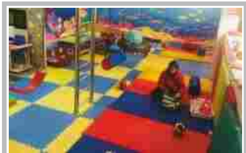
Occupational Therapy Room for Kids