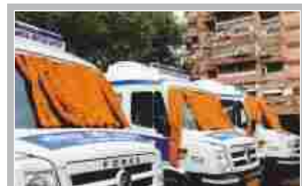
Ready to serve the community-MMU PTC