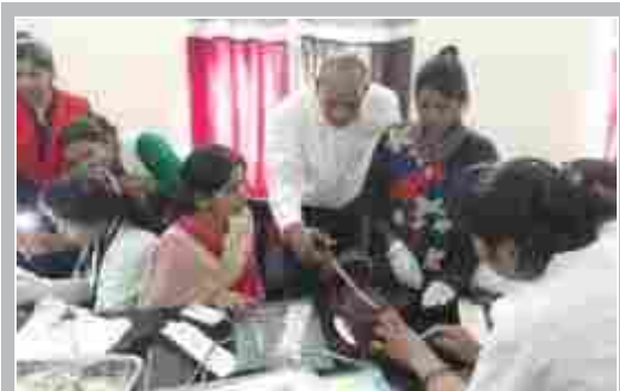
HLPPT Technical team conducted Training sessions at CG

Since 2012, HLPPT is implementing a skill building programme on IUCD insertion through No touch technique of IUCD's insertion of Public health service providers including Auxiliary Nurse Midwife, Ladies Health Visitors, Staff Nurses and Medical Officers. So far we have trained more than 35000 health providers across 12 States. In Chhattisgarh, HLPPT is providing the IUCD/PPIUCD training in the 27 districts of Chhattisgarh in FY 18-19. Total 2873 Health Service Providers have been trained from 2157 in which total 358 training has been provided FY 18-19. Facilities which were identified as Service Delivery Points (SDP) by State, including 153 Master Trainers. The post-training