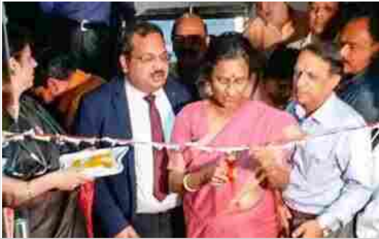
Guest of Honour with CEO-HLPPT during the Inauguration