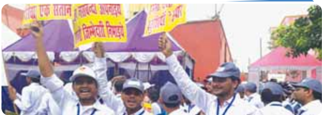
HLPFPT's Skill Development team conducts Awareness Rally in Sitapur, UP. GDA (General Duty Assistant) students of Skill Centre Sitapur participate in the event.