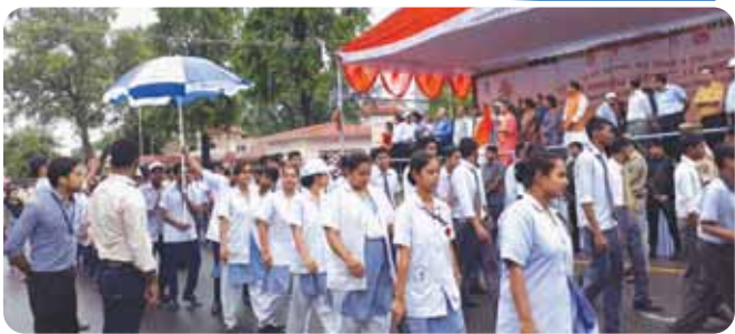
HLPFPT Team participated at the mega awareness rally held in Lucknow on 11th July