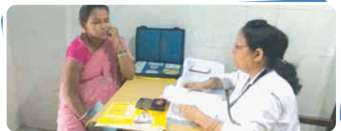
HLPFPT with Laerdal Global Health mark WPD 2017 at PMCH, Patna in Bihar, with counselling on Family Planning & antenatal check-ups.