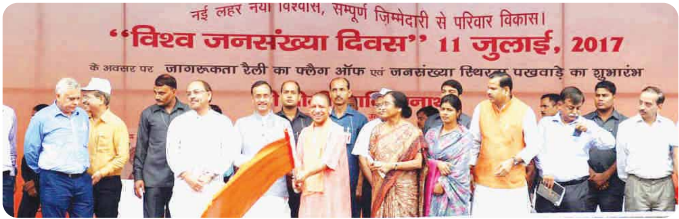
Shri Yogi Adityanath, Hon'ble Chief Minister of UP, flags off WPD 2017 celebrations in Lucknow. HLPFPT, along with other development partners, participated in various WPD events held over a fortnight in the state