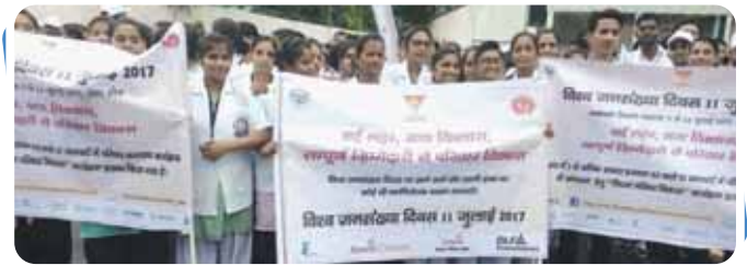
HLPFPT Team spread messages on Family Planning and Population Stabilisation among the masses on WPD 2017 in UP