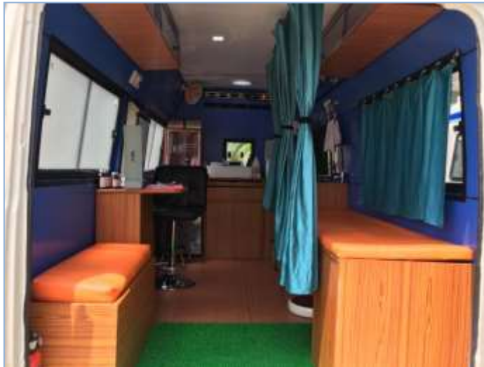
Picture of the fabricated MMC for reference

Name & Signature of Authorized Signatory Name & Seal of the Firm/ Agency Address: Telephone/Fax