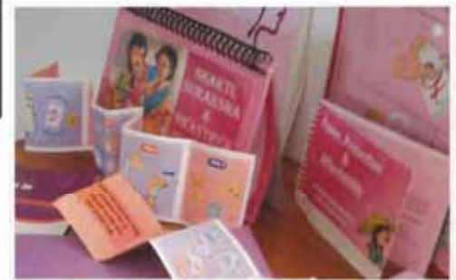
HLL's FC communication material and products on display