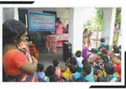
Community meeting on reproductive health issues held at Jambon Village, Burdwan district, West Bengal during WPD

As a CSR partner for Suzlon, HLPPT is implementing MMU project at selected 57 villages of Jaisalmer district in Rajasthan. To mark World Population Day this year, the MMU team organised a couple of activities involving students and community members at Government Higher Secondary School at Mulana village in Jaisalmer. The activities included: a Rally, where 130 school students and villagers participated, and a Painting and Essay Competition on the topic "Ill Effects of Increasing Population", with around 40 participants. Moreover, community meetings were organised with adult men and women of the village, briefing them on basket of choice on family planning, especially regarding spacing methods.