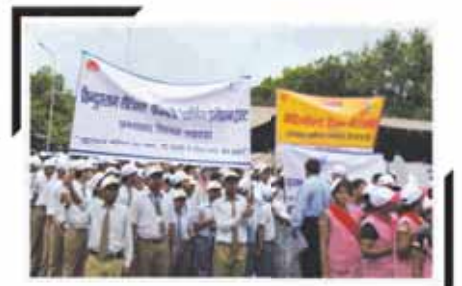
Awareness rally with more than 5,000 participants including students, NGOs, nurses, SIFPSA staff, NRHM staff etc, held at Lucknow on 11 th July 2015

The celebration of WPD fortnight in UP began with an Awareness rally with more than 5,000 participants. These included students, NGO representatives, nurses, SIFPSA staff, NRHM staff etc. The rally