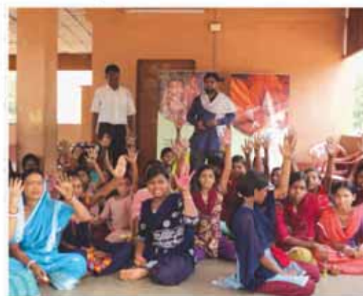
Mothers, adolescent girls and AWWs at Diarrhoea Prevention Camp at Kataberia Village, Burdwan

In yet another move, MMU Durgapur team conducted Diarrhoea Prevention and Management Camp for Mothers, Adolescent Girls and Anganwadi Workers (AWWs) at Kataberia Village (Faridpur Block, Burdwan District) on 12th May 2015. HLFPTT has been operating MMU in Durgapur with support from Essar Oil as a part of Essar's Corporate Social Responsibility initiative. The essential objectives of the Camp were to: Create awareness about diarrhoea & its prevalence during summers; Apprise community members about the symptoms of diarrhoea and preventive measures; and State the importance of ORS for Diarrhoea Management. The included an Awareness Session with 32 participants who were oriented on various aspects of diarrhoea management including the method of making ORS at home. MMU Team also requested AWWs to immediately take care of the small children suffering from Diarrhoea and provided them with a module of Diarrhoea, ORS with container & bottles for such emergencies. Following this, the MMU also clinically assessed patients.