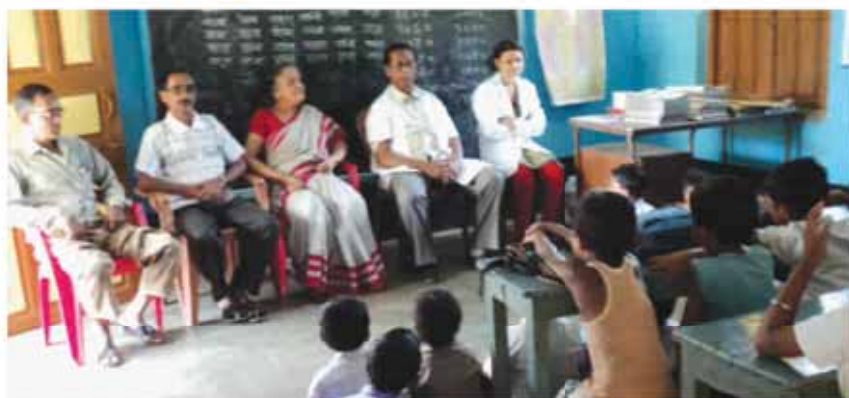
School children at Sarenga village attending session on personal hygiene and ways of protection against diarrhoea

Considering the spurt in cases of diarrhoea among children during summers, HLFPTT's Mobile Medical Unit (MMU) Team at Durgapur, West Bengal, organised a Diarrhoea Awareness Session among School Children at Sarenga Village (Kanksa Block, Burdwan District) in May 2015, whereby the MMU Team motivated children to maintain personal hygiene and adopt healthy practices for preventing diarrhoea. The Team apprised school children about diarrhoea symptoms, prevention & ways of protection from severe heat and concluded the session with distribution of water bottles among children.